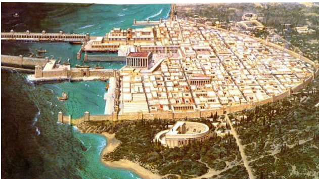
Ancient Caesarea by the Sea